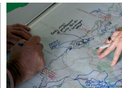
EDS seeks interest in collaborative planning