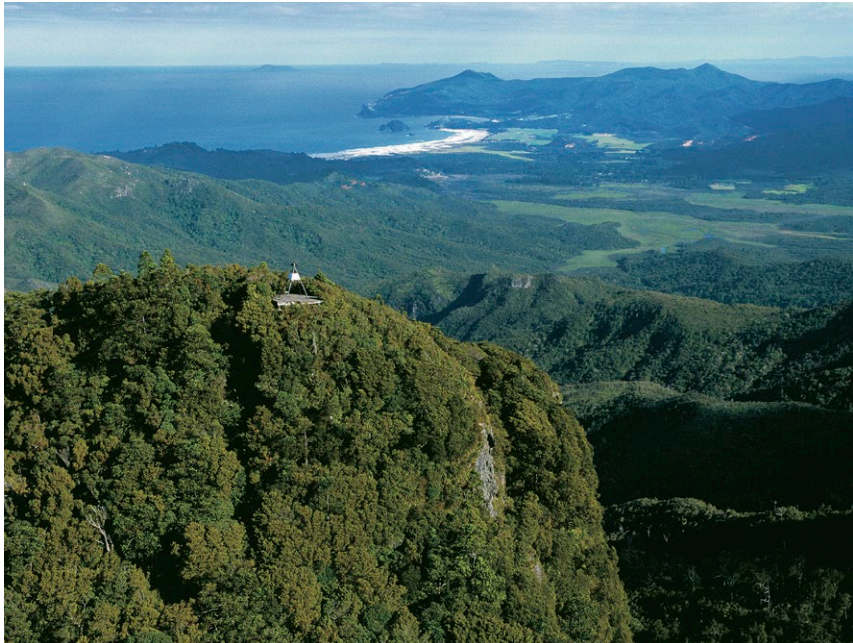
Hirakimata on Aotea – Great Barrier Island

prejudice arising from the operation and impact of native land laws.