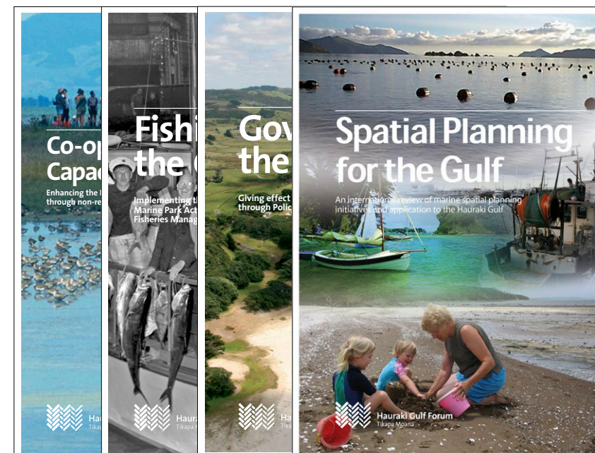
Co-operation, Capacity, Charisma; Fishing the Gulf; Governing the Gulf; Spatial Planning for the Gulf guides