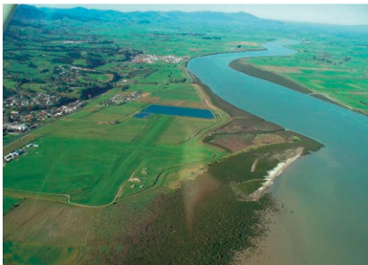
Mt Te Aroha and Waihou River