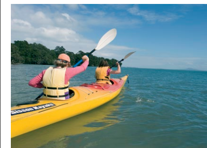
Gulf health critical for many uses