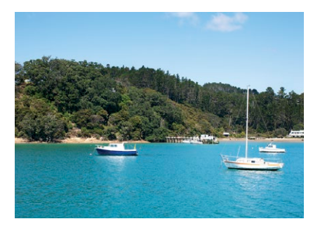
New perspectives on coast.

"The Gulf is one of the most heavily used areas of coastal space, and is the most obvious place to benefit from a process of Marine Spatial Planning and charging of commercial users."