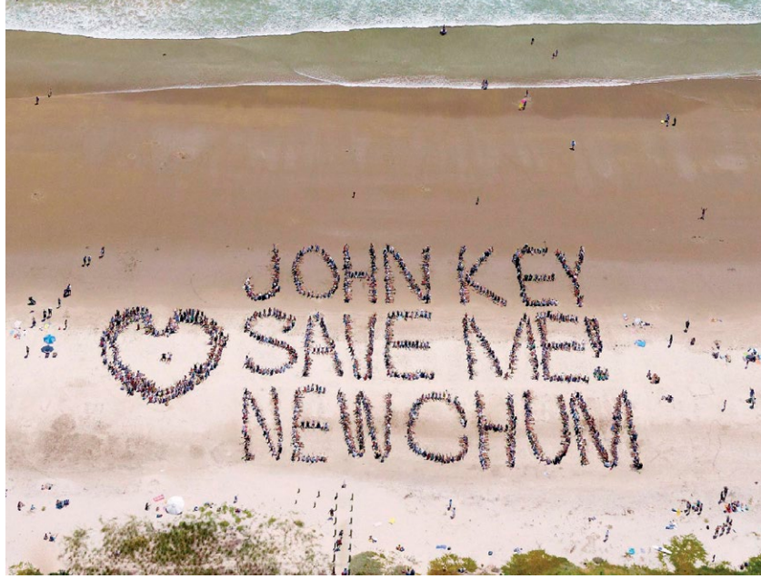
New Chum message still relevant

A water-based survey was undertaken earlier this year to photograph the