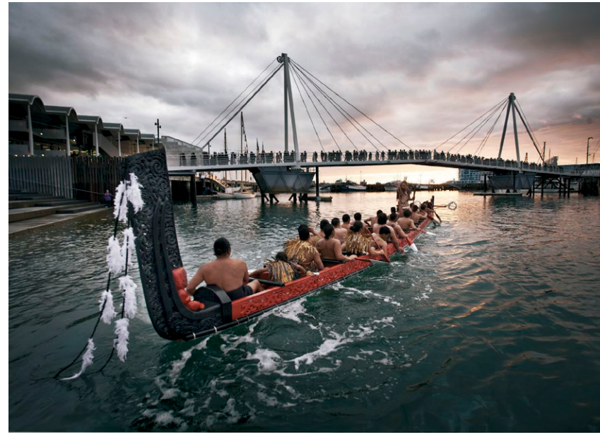
Post settlement environment provides opportunities.

The Treaty settlements process has been a primary driving force for change but is not the only agent.