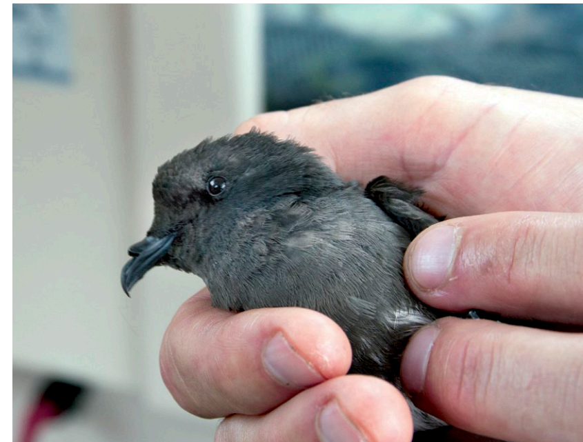
NZ storm petrel shows signs of breeding locally.