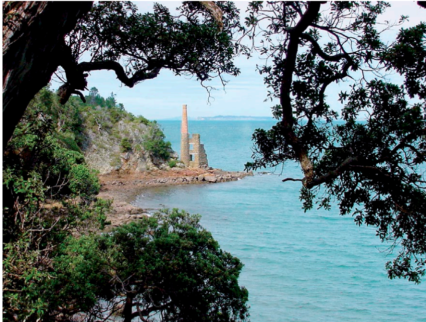
Kawau icon restored.

space within the two zones. The first 20 per cent of the area must be allocated to the Māori Trustee.