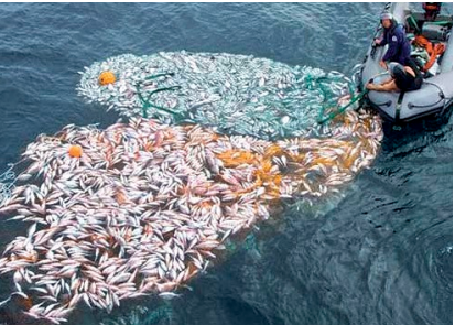
Kawau fisher found guilty of dumping catch.