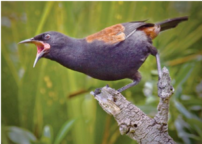
Tieke song to be heard on mainland.