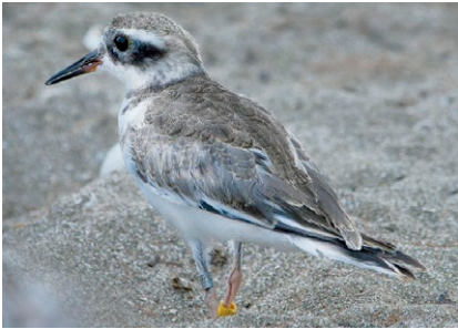
Rare shorebird back on Motutapu.