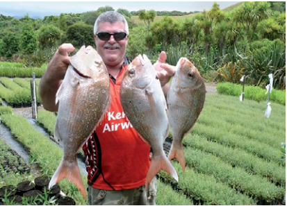
Raglan restoration champion reaps rewards.